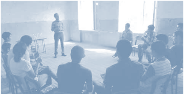
ECMI Caucasus, Training