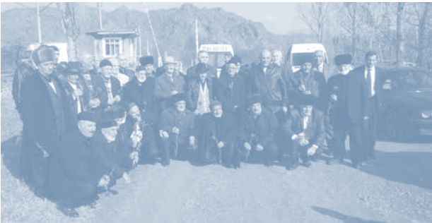
ECMI Caucasus, Mesh

Following the recommendations of ECMI Caucasus, the new strategic priorities and the respective Action Plan will focus on minority participation in public life. ECMI Caucasus strongly supported inclusion of gender perspective in the new strategy, as well as a special chapter for action to integrate Roma population. The gender perspective relates in particular to the report on needs assessment of minority women prepared by ECMI Caucasus for UN Women to be aligned with the Gender Equality National Action Plan adopted by the Georgian Parliament.