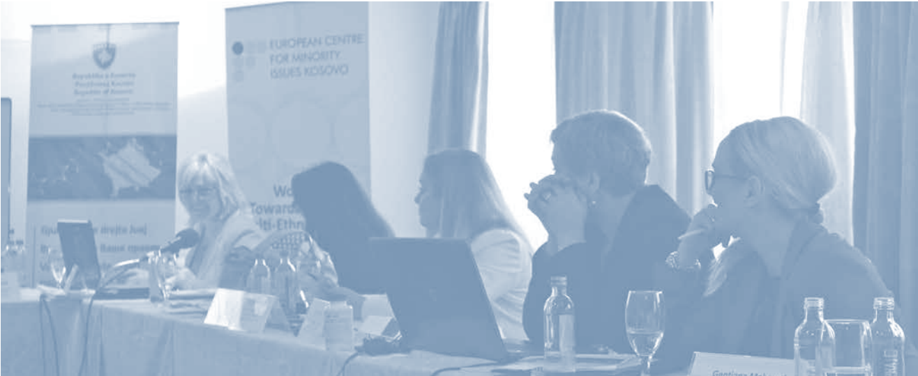
ECMI Kosovo, Strengthening the protection of language rights in Kosovo

A detailed training programme was developed, which offered an overview of the national legislative and constitutional framework required for the successful development of the responsibilities of the Assembly Members. The aim of this project is to improve employment opportunities for local communities and create favourable conditions for economic growth within municipalities.