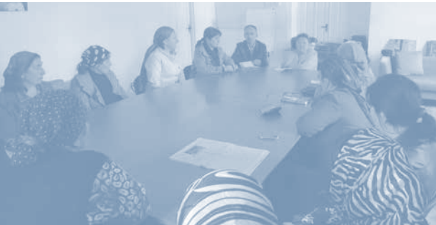
ECMI Caucasus, Pankisi

Continuing the series of regional conferences on Freedom of Religion or Belief with the support and in collaboration with the Embassy of The Netherlands in Georgia, a second conference took place in September, this time including the participation of Azerbaijan. The main goal of the conference was to discuss implementation of freedom of religion or belief out of international standards and from the institutional, legal and advocacy perspective; to share experiences between state structures, ombudsman, institutions, religious establishment and religious organizations.