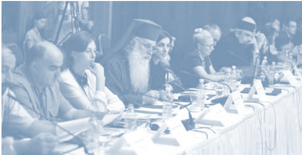
ECMI Caucasus, FORB3