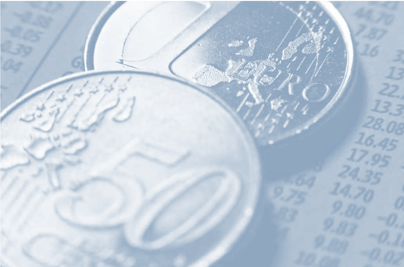
ECMI Externally Funded Projects 2014 Responsible Donor Institution Title Grant size Project period