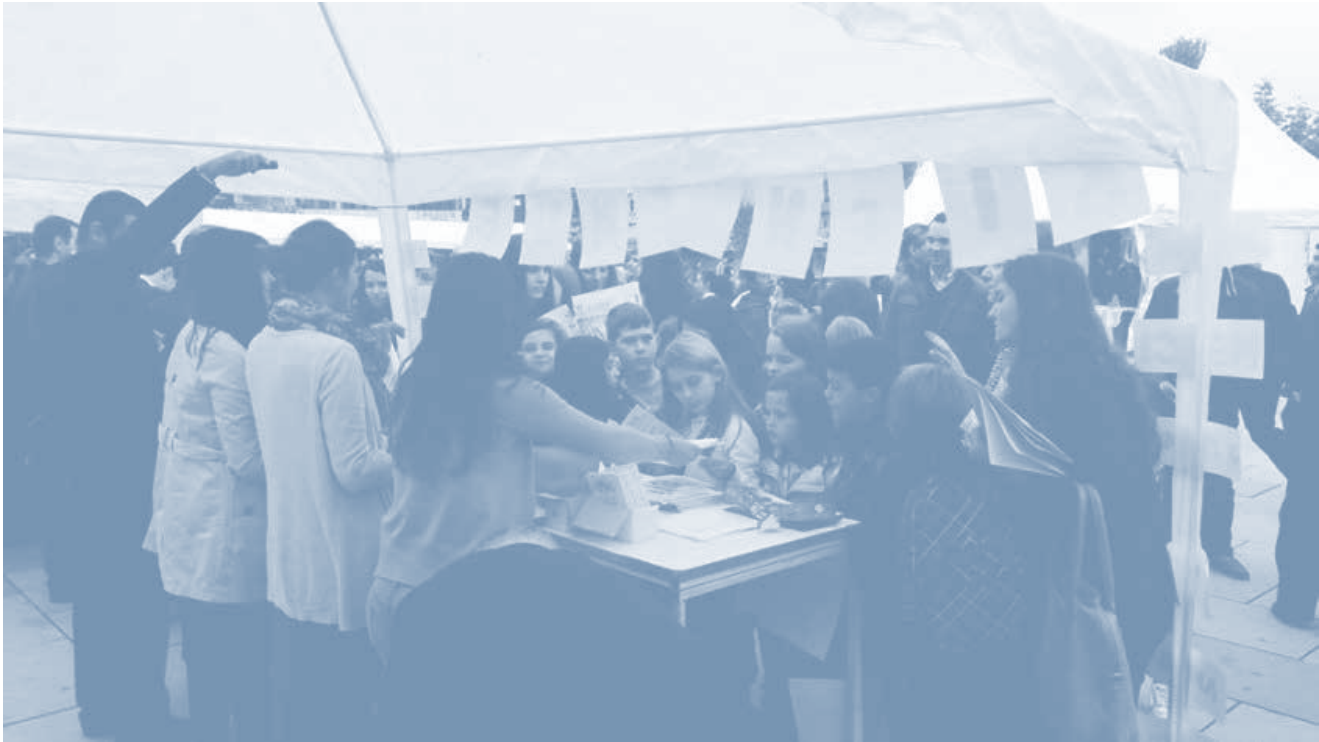
ECMI Kosovo, European Day of Languages 2014

Moreover, a comprehensive publication of a report on 'The Development Potential of Tourism and Agriculture: a Study of Newly-established Serb-majority Municipalities in Southern Kosovo' was issued and disseminated. This study consists of a quantitative and qualitative analysis of the current potential for the development of agriculture and tourism in newly established Serb-majority municipalities in southern Kosovo.