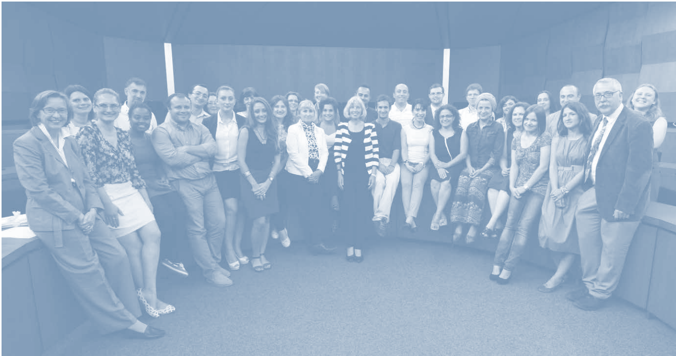
ECMI Summer School

Welcoming participants and lecturers in Flensburg and introducing them to the history and achievements of the German-Danish border region of Schleswig-Holstein, the Summer School has been fostering cooperation and networking not only among participants, but also between local, regional and international partners.