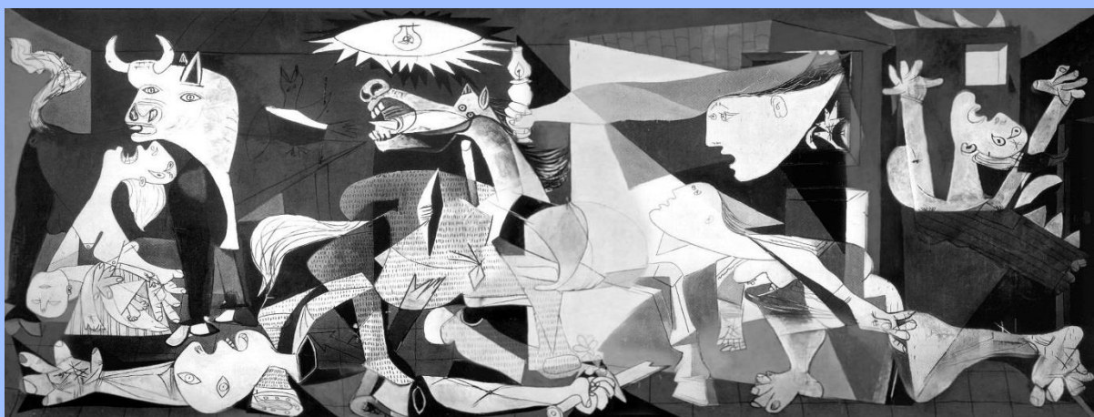
Pablo Picasso's horror of the Nazi German bombing of Guernica (Spain), during the Spanish Civil War on April 1937, inspired one of his masterpieces: Guernica.

Report of high-level expert meeting Vienna, 29 – 30 May 2017 European Union Agency for Fundamental Rights