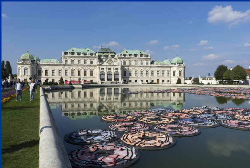
Ai Weiwei's major solo exhibition, presented in 2016 at the 21er Haus in Vienna, reacting on social realities of migration between countries and continents.

A related issue is to question how museums should address display items which have been "plundered" from other cultures, such as the Elgin Marbles in the British Museum, or Indigenous artefacts in numerous European museums. Of great relevance in Europe are incidences of art housed in museums, which has been looted from persecuted owners, such as Jews in the years up to and during the Second World War.