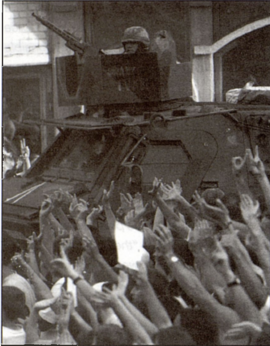
Local people give a rapturous welcome to German forces. (Prizren, June 1999)

appropriately the military machine that was conducting these attacks. The Alliance engaged in this campaign only to convince President Milosevic to comply with the reasonable demands set out above. The end result was a far worse settlement for the Yugoslav government than had been on offer at Rambouillet.