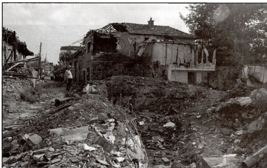
Serb forces caused immense devastation in Kosovo.

It is important to always keep in mind the sheer scale of the recent tragedy in Kosovo, as well as the historical backdrop. The resulting physical and psychological wounds will take time to heal. There must be realism about what improvements can be expected in such a short time. NATO is determined to pursue its even-handed approach to all peoples of Kosovo and to support the goals set out by the international community in UN Security Council Resolution 1244.