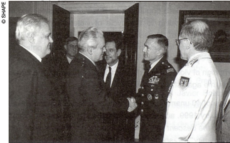
NATO Secretary General Javier Solana, the Supreme Allied Commander Europe, General Wesley Clark, and the Chairman of the Military Committee, General Klaus Naumann, meet President Milosevic in autumn 1998 – one of many attempts to warn of the consequences of not seeking a political settlement for Kosovo.

in a Serb counter-offensive in late summer, that was conducted in a typically indiscriminate manner. The office of the United Nations High Commissioner for Refugees (UNHCR) estimated that well over 200,000 people were displaced as a result. Around 50,000 people were forced to camp out in the open, in increasingly bleak conditions. So in autumn 1998, a series of diplomatic initiatives were taken, including visits to Belgrade by NATO's Secretary General, Javier Solana, US Special