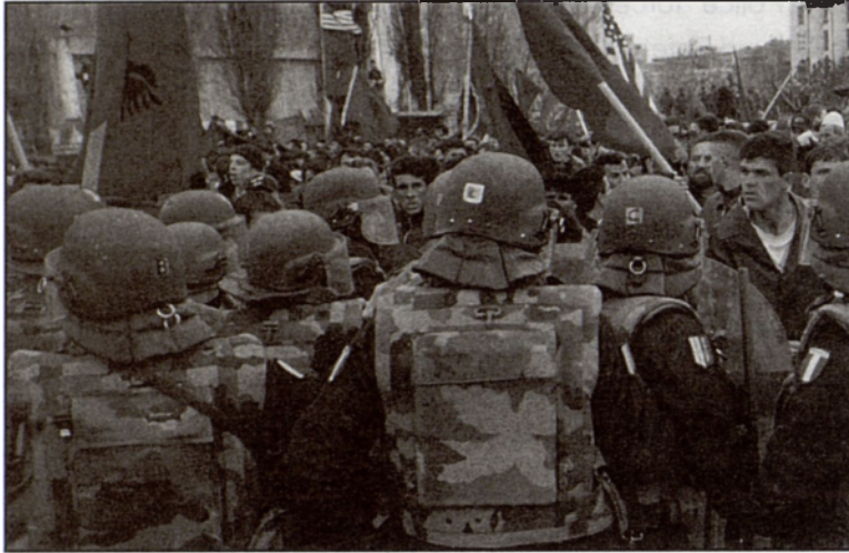
French KFOR troops hold back demonstrators in Kosovska-Mitrovica. (February 2000)

for some time to come. KFOR itself must therefore remain properly and fully resourced and manned.