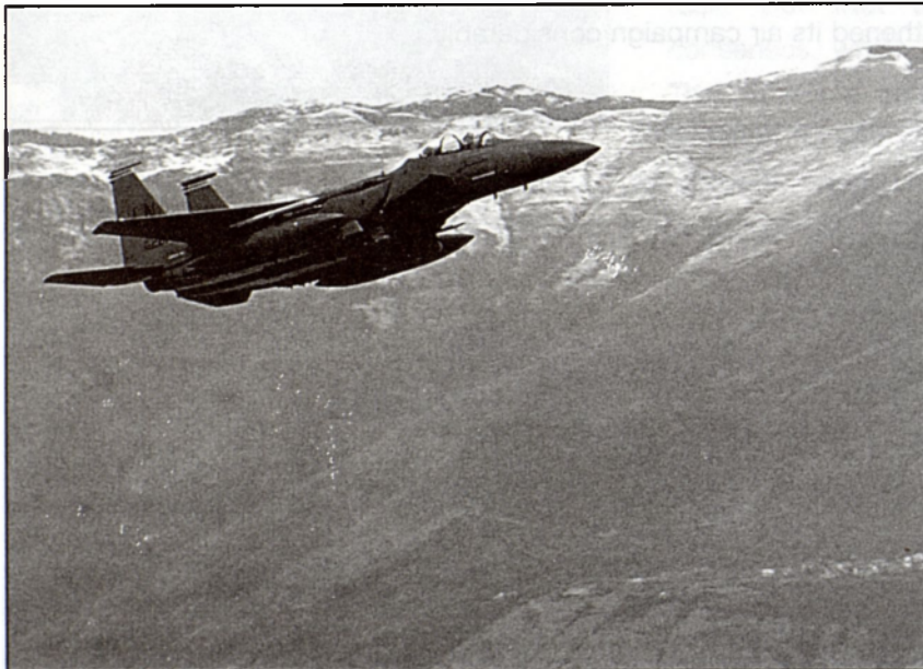
A US F-15E Strike Eagle takes off from its Italian base.

Serbs. But the constant presence of NATO aircraft inhibited the Serbs by forcing them into hiding and frequently punishing them when they did venture out.