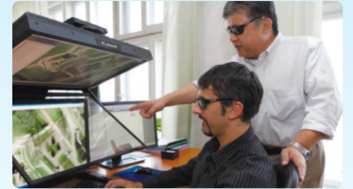
The Project for Capacity Development of Digital Basic State Mapping (Serbia, TA)

Even if the respective nations continue to work together to undertake a successful transition to a global market, there is a broad spectrum of factors to consider among the countries in the region. When it comes to the consolidation of peace and economic development, nothing is more essential than private sector development, which is a vital contributor to the region's successful transition to a global market. As a result, the development of small and medium-scale enterprises (SMEs), which includes entrepreneurship and the promotion of trade and investment, are of principal importance. From these perspectives, JICA supports human resources development for promoting SMEs and provides policy support to enhance trade and investment. The countries in the Western Balkan region have a net advantage when it comes to standards related to human resources, including the quality of facilities and more reliable support institutions. Thus, in carrying out the spirit of co-operation along with private sector development in this region, JICA is prepared to offer multi-faceted assistance appropriate to each country's particular needs.