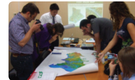
Training Program for Mapping Technology in Japan (Japan, TA)