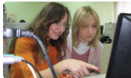
Bijeljina High School