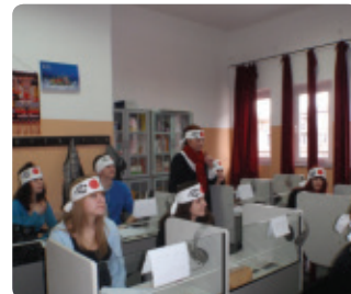
Japanese Language Class Supported by a Japanese Volunteer in Belgrade Philological High School (Serbia, TA)