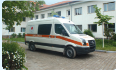
Donated Emergency Vehicle for the Improvement of the Medical Equipment of the Regional Level Emergency Centers (Albania, GA)