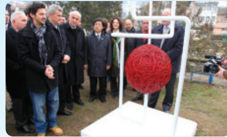
Inauguration of the Memorial Monument for the Solid Waste Management Project in Prizren (Kosovo, TA)