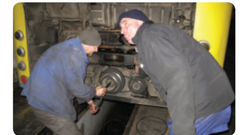
Daily Maintenance of Donated Buses in Sarajevo (Bosnia and Herzegovina, GA)