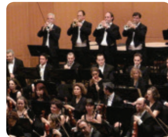
Donated Musical Instruments to Belgrade Philharmonic Orchestra (Serbia, GA)