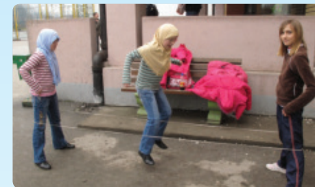
Children in the Constructed 21. Marta Elementary School (Bosnia and Herzegovina, GA)

*The Government of Japan recognized Kosovo as an independent country on March 18, 2008.