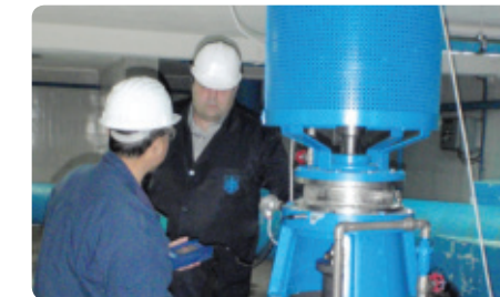
The Project for Urgent Rehabilitation of Water Supply System in Podgorica (Montenegro, GA)