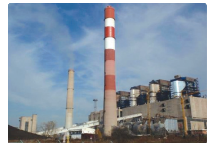
The Flue Gas Desulphurization Construction Project for Thermal Power Plant Nikola Tesla (Serbia, ODA Loans)

Along with the assistance required for economic development, JICA is also working on tackling the ongoing environmental issue. However, such essential and wide-ranging issues cannot be solved by one country alone. Environmental policies must be considered when providing assistance, and regionally comprehensive measures must be taken in accordance with the situations of each country.