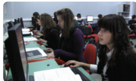
Sarajevo Second High School