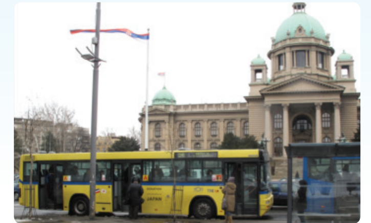
Donated Bus Running in the City of Belgrade (Serbia, GA)