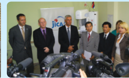
Hand-Over Ceremony for Donation of Medical Equipment for Breast Cancer Screening and Prevention (Serbia, GA)