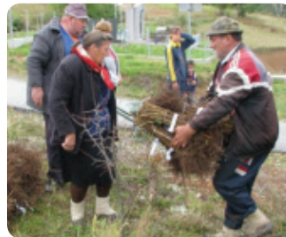
The project for confidence-building on agricultural development in Srebrenica (Bosnia and Herzegovina, TA)