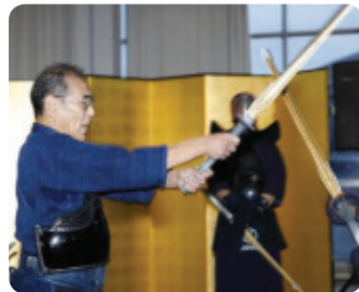
Kendo Training by a Japanese Volunteer (Serbia, TA)

With this neutrality of its character, JICA focuses on the following three areas of common concern in the Western Balkan region: Consolidation of Peace, Private Sector Development and Tackling Environmental Problems .