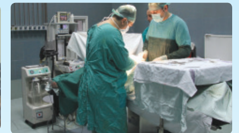
Donated Medical Equipment for Improvement of Medical Equipment on South Regional and District Hospital (Albania, GA)