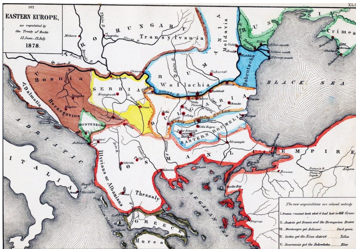
Figure 1: Map of the Treaty of Berlin, 1878.