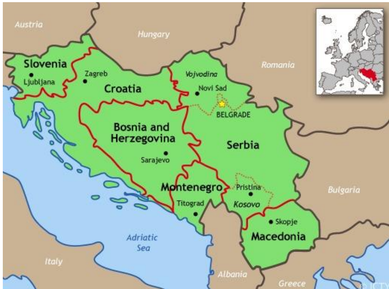
Figure 2: Map of the Socialist Federal Republic of Yugoslavia, 1991.

Source: What is the former Yugoslavia? United Nations, International Criminal Tribunal for the Former Yugoslavia.