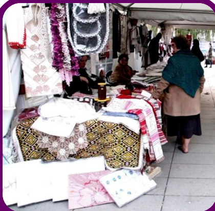
On Mother Teresa Boulevard, clients peruse women's hand made products.