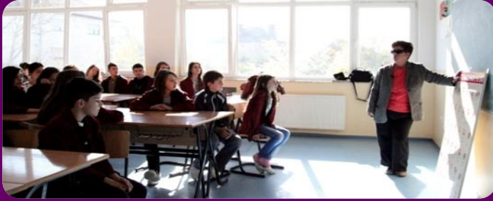
Bajramshahe explains Braille to students in Prishtina.

tables in two primary schools in Prishtina. The nearly life size tables are used to explain the Braille alphabet to pupils within public schools. Thus, introducing the tables also has involved organizing lectures for approximately 140 pupils and teachers about Braille, as well as sharing information about the particular needs that blind pupils have.