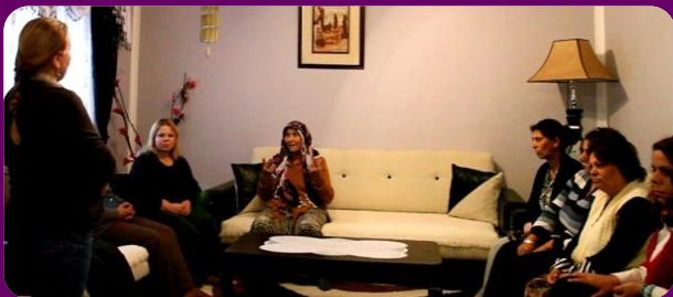
Women discuss the challenges that they face during a training in Prizren.

More than 400 women have received information through Foleja 's Kosovo Women's Fund-supported initiative (€2,740).