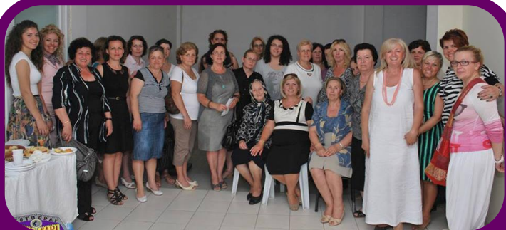
Gruaja Hyjnore celebrates the opening of their new space, provided free of charge by the Municipality of Gjilan.

In addition to gaining knowledge about their rights, through this initiative 36 women have sold their products at fairs. The four women from the women’s shelter earned approximately €400 in total from the sale of their products. This initiative thus has contributed to empowering women, both economically and towards their enhanced participation in decision-making.