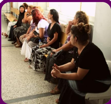
Women await their turn, visiting the gynaecologist free of charge.