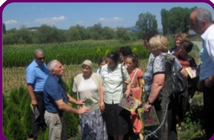
Members of Krusha e Vogel Women Farmers' Association learn seeding and business techniques.

Although the project ended in July, eight women plan to open their own businesses in the future, where they will continue using the knowledge that they gained through this initiative.