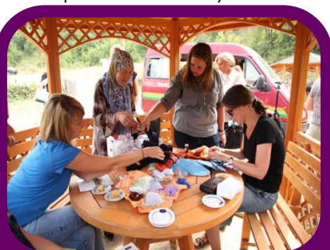
Women sell their handmade products to tourists in Novoberd.