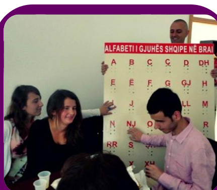
Blind youth test the Committee's Braille Tables for schools.

In close cooperation with two school directors, the Committee has introduced Braille