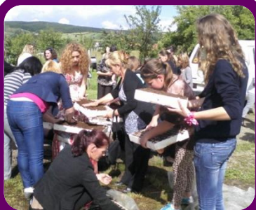
Women learn techniques for planting seeds.