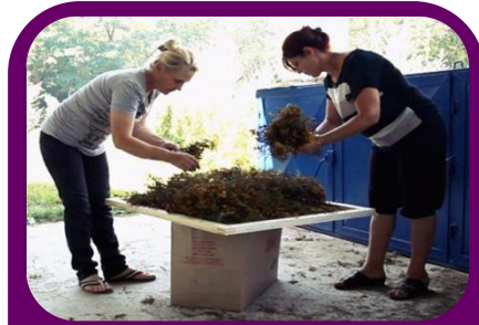
Ikebana members dry wild teas in Shtrpce.

An interethnic group of women in Shtrpce always dreamed of forming an organization through which they could collect and market herbal teas. They aimed to prepare products with quality ingredients in an environmentally friendly manner. Some medicinal