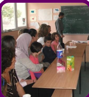
Bliri involves mothers and daughters in discussing their health.

Bliri ’s initiative has received support from the Kosovo Women’s Fund (€2,500).